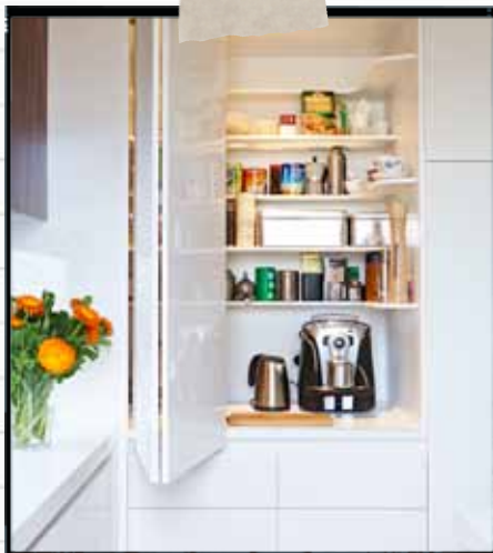
KITCHEN Cabinetry from The Cabinet & Furniture Workshop conceals clutter.

"The main type of wood used here is spotted gum , which is local, so it's a thumbs up for the environment"