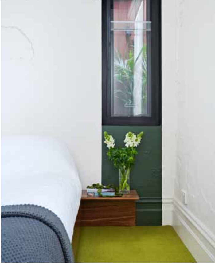
KITCHEN (top left) Made from recycled bottles, the green glassware is by Tord Boontje for Artecnic. BATHROOM (top right) Spotted gum panelling finished in Intergrain UltraClear Interior Satin conceals the linen store, while 'Monaco' 300mm x 600mm porcelain tiles in White from Signorino Tile Gallery complete the clean, modern look. STAIRCASE (bottom left) Slim-line cabinetry adds extra storage and display space. BEDROOM (bottom right) To emphasise the soaring ceiling, the couple opted for a low-profile bed and tables – seek similar at Planet. >