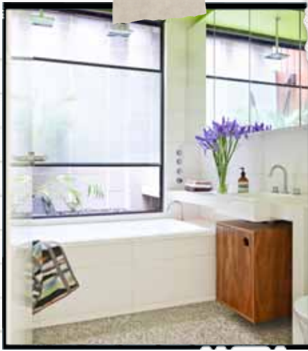
BATHROOM Phoenix 'Kubus' showerheads from Reece and a coat of Resene 'Christi' on the ceiling add to the home's rainforest feel.