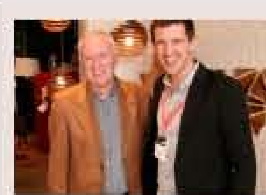
Timber to Tokyo – The Winner