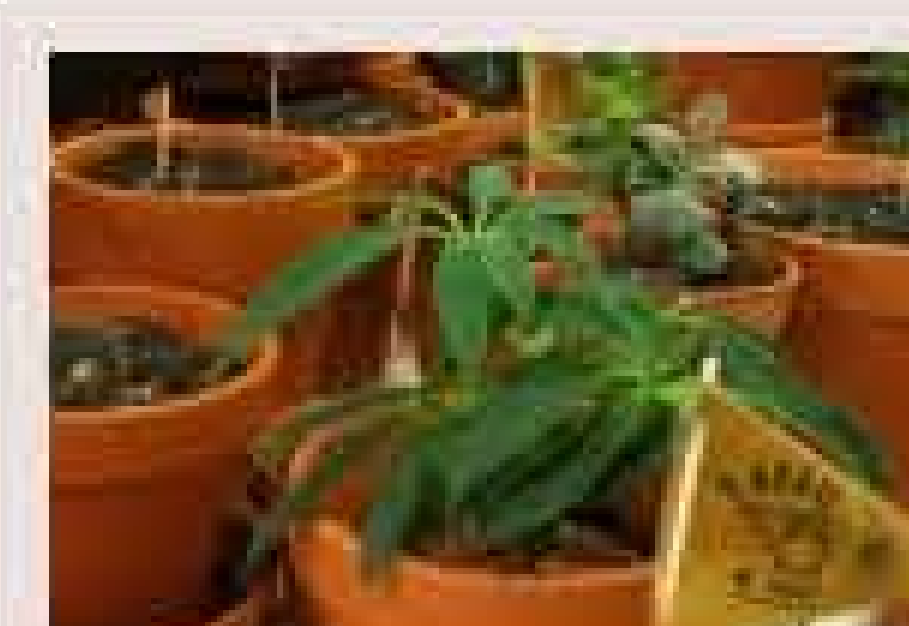
Re:new in Tokyo