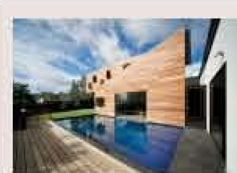
Trojan House by Jackson Clements Burrows